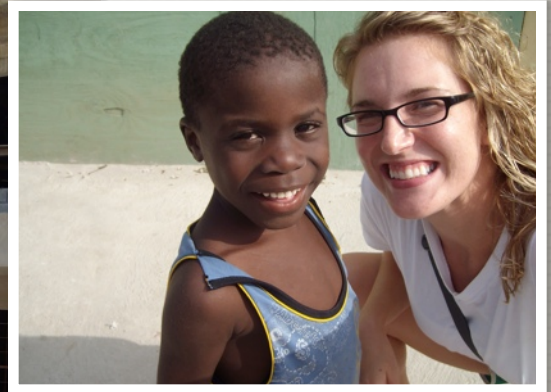
PICTURED: BAPTIST ORPHANAGE CONSTRUCTION IN DELMAS 19, CHILD FROM BAPTIST-SPONSORED ORPHANAGE IN GRESSIER.