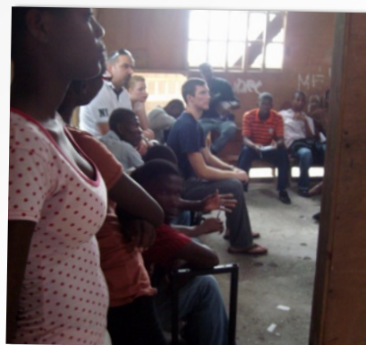
ATTENDED ENGLISH CLUB,