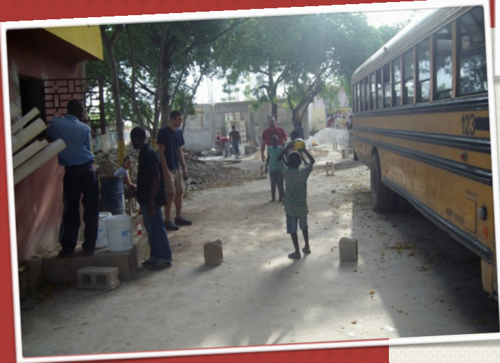
FEATURED: 1ST DAY OF PAINTING, THE RUBBLE INSIDE/OUTSIDE OF THE CATHEDRAL, ONE OF THE HOUSES THE WM BCM CREW BUILT, SOCCER AT THE GRESSIER ORPHANAGE.