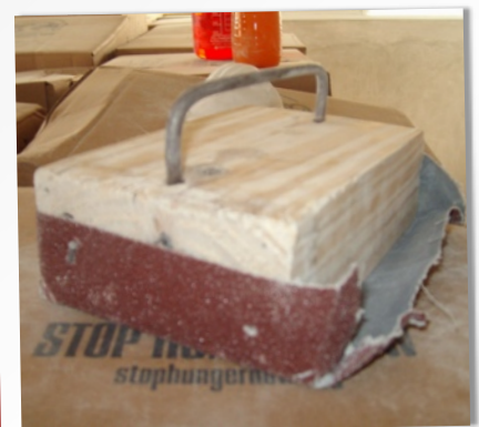
AND SANDED AND PAINTED THE DELMAS ORPHANAGE.