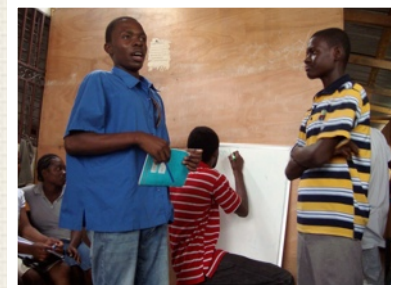
ENGLISH CLUB OUTREACH