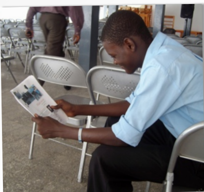
WE CAUGHT UP WITH OLD FRIENDS,